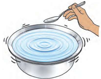
13.5 : Vibrations in the water and production of sound

Why are waves formed on the water in the pot?