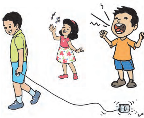
13.7 : Various sounds

A loud sound is harsh to the ear. Such sounds produce noise.