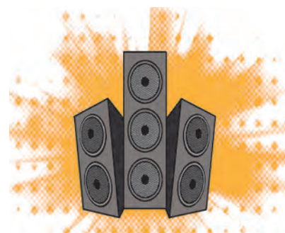
13.2 : Speakers

Put off the music. What do you feel now?