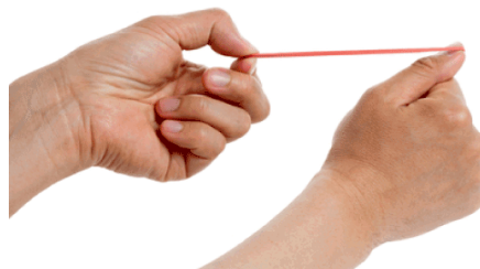
13.3 : A stretched rubber band

Apart from the movement of the rubber band, what else did you notice?