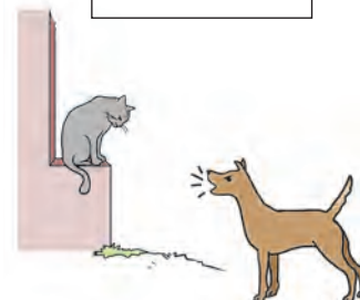
13.1 : Examples of various sounds

1. Which sounds do you hear during the recess in the school?