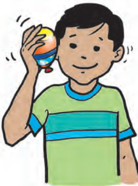
13.6 : Propagation of sound