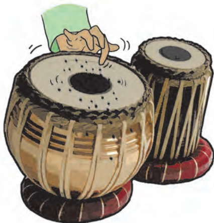
13.4 : Tabla

3. Spread some sawdust or mustard seeds or sand on the diaphragm of a tabla. Knock on the diaphragm lightly with a finger.