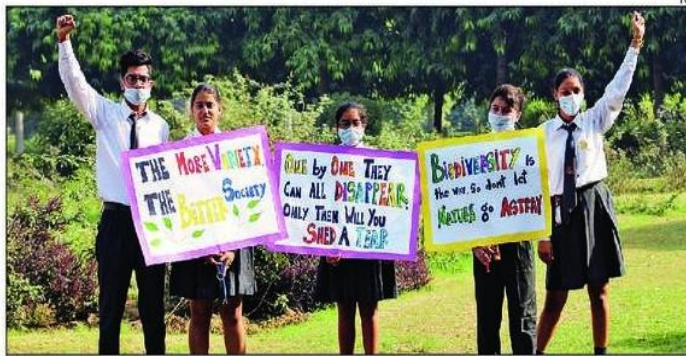
Students of Ajanta Public School went to the biodiversity park and raised questions over the road plan