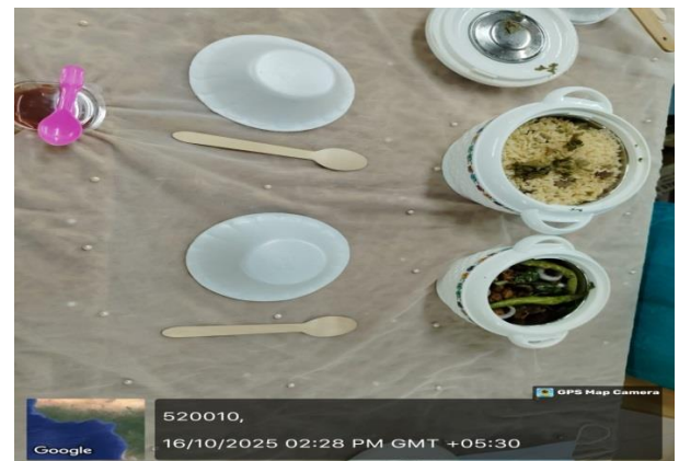
Students prepared food items for the World food day competition