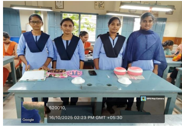
Stutents prepared and exhibited food items and participated in the World Food Day competition.