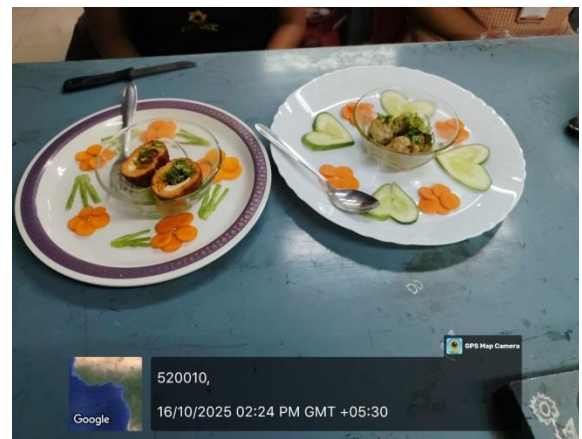
Students prepared food items for the World food day competition