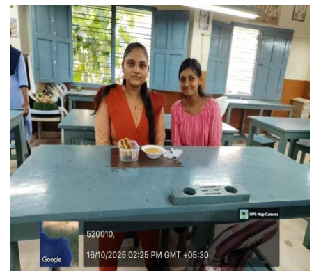
Stutents prepared and exhibited food items and participated in the World Food Day competition.