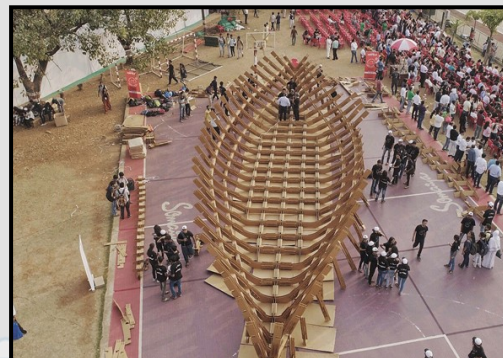
World record attempt to build 'World's Largest Cardboard Sculpture'