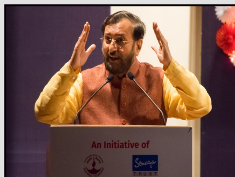
Mr. Prakash Javadekar, Hon. HRD Minister addressing the audience