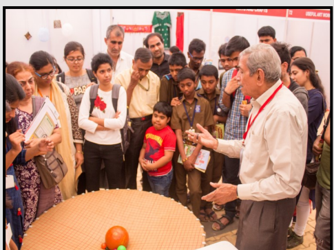
One of the speakers sharing his insights with students