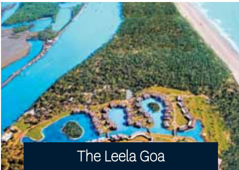
The Leela Goa