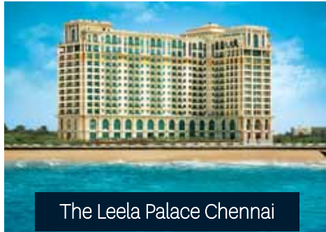
The Leela Palace Chennai