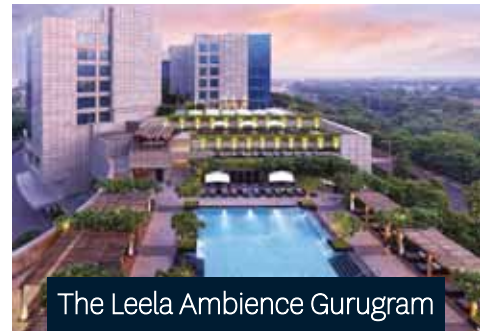
The Leela Ambience Gurugram