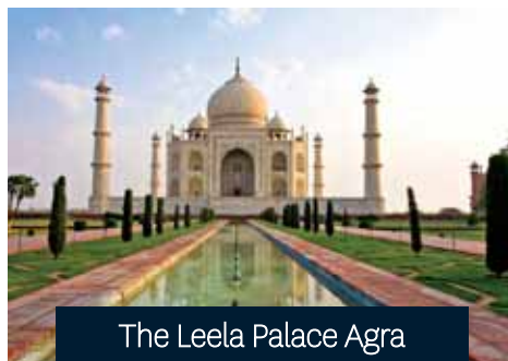
The Leela Palace Agra