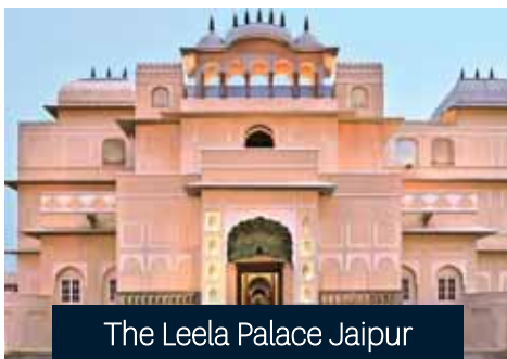
The Leela Palace Jaipur