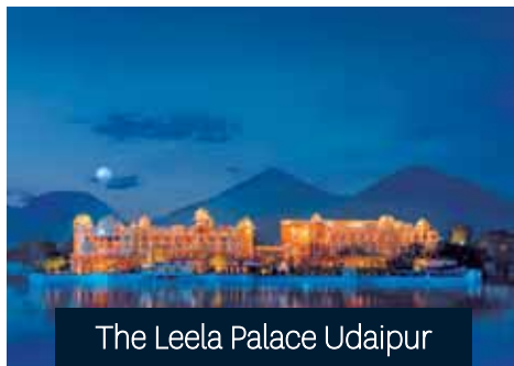
The Leela Palace Udaipur