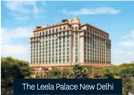
The Leela Palace New Delhi