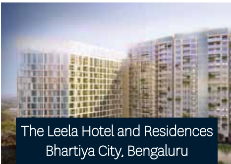
The Leela Hotel and Residences Bhartiya City, Bengaluru