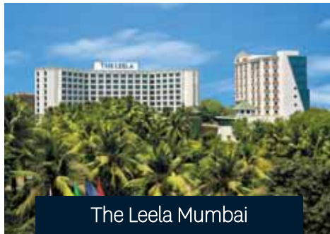
The Leela Mumbai