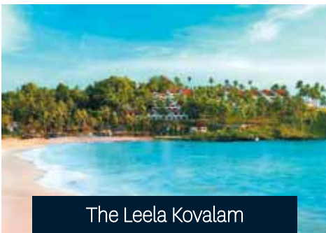
The Leela Kovalam