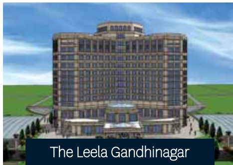
The Leela Gandhinagar