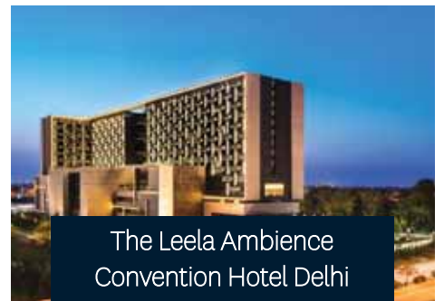
The Leela Ambience Convention Hotel Delhi