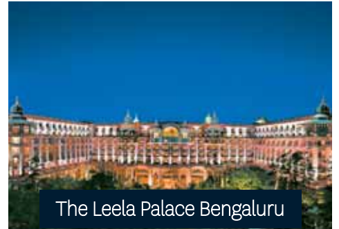
The Leela Palace Bengaluru