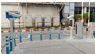
Location: Thailand Device: LPRS1000 and ProBG3000