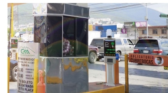
Location: Mexico Device: LPRS1000 and POS